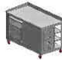
AMT-10021, Fixturing Kit, 599 pieces, System 25